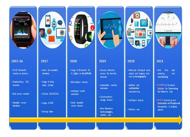
Figure 1: Advancement of Internet of Things technology in medical field.

The elderly citizens in Western countries are burdened to have physical facilities, and treatment costs are rising far faster than the general inflation rate [5]. Since many healthcare facilities are already online, they may benefit from the expanded access to high-speed connectivity, low-cost cloud computing, and in-depth data analysis. In this new scenario, MIoT technology is attractive. Not only will it enable the personalization of clinical care delivery, enabling significant cost savings, however it will also make it possible for better results by enhancing flexibility, personalization, and the efficient use of data obtained. MIoT reduces the duration it takes to detect medical conditions [6], provides efficient and high-quality care that reduces hospital costs [7]. By connecting to MIoT, patients can give doctors continuous feedback